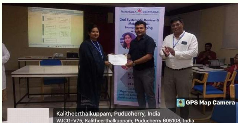
Kalitheerthalkuppam, Puducherry, India WJCG+V75, Kalitheerthalkuppam, Puducherry 605108, India