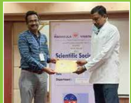
Case report on VATS Surgery for Thyrectomy