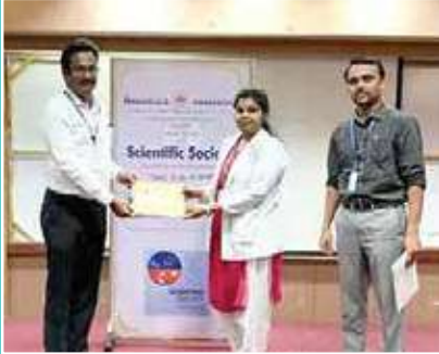
Article on Clinicopathological study of cutaneous horn in a tertiary care centre in South India.