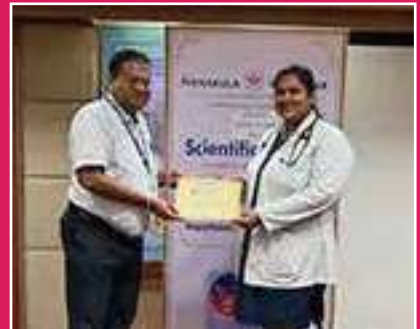
Case report on Isolated Mycysticercosis with solitary Neurocysticercosis.