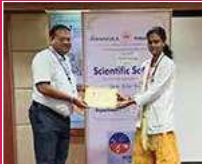
A study on clinical and immunological pattern of systemic lupus erythematosus patients in a tertiary care hospital- A Retrospective study