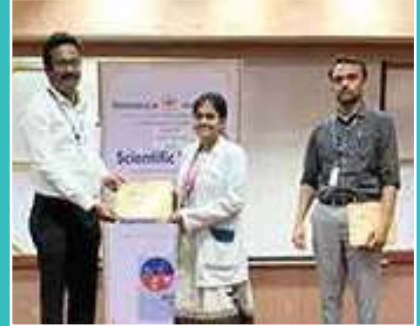
Article on Actinic cheilitis – A retrospective study of 26 patients in tertiary care hospital in South India