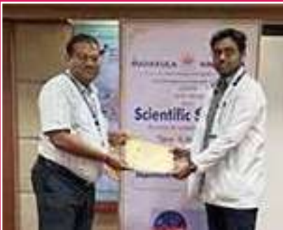
Article on Study of Correlation of Monocyte to HDL ratio with Carotid Artery Intima media thickness in acute ischemic stroke patients.