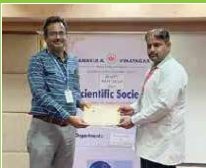
Case report on Anaesthesia for B/L TMJ Ankylosis