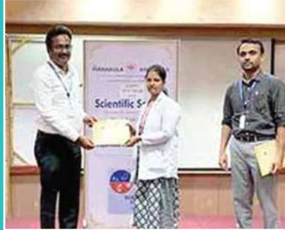
Article on Lichen sclerosus et atrophicus – Beyond the genitalia – A retrospective study