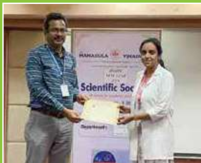
Case report on Successful Regional Anaesthesia technique in a patient with severe kyphoscoliosis