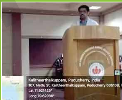
Triglyceride Glucose index in predicting micro & macro vascular complications of diabetes – An Original Article