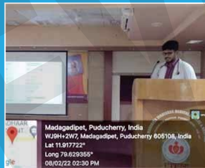
MELIOIDOSIS – an uncommon infection with fatal outcomes – A Case Report