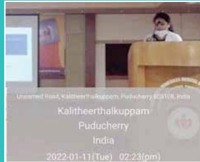
Polysensitivity in Patch Test done in Cement Dermatitis – A Unique Phenomenon (Original Article)