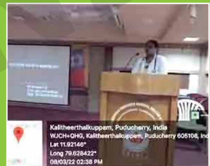
Prevalence of spontaneous ascitic fluid infection and its microbiological profile in decompensated cirrhotic liver disease patients in a tertiary health care hospital in Puducherry