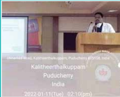
Prevalence of scabies and its socioeconomic as well as environmental determinants among rural population of Tamil Nadu (Original Article)