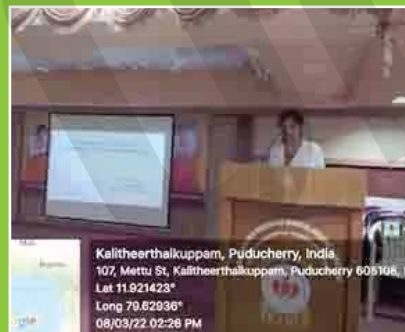
SLE manifesting as recurrent young stroke – A Case Report