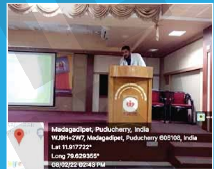
HODGKIN'S LYMPHOMA – a rare cause for paraplegia – A Case Report