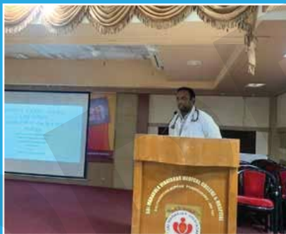
A case of ANCA negative Churg Strauss Syndrome – (A Case Report)