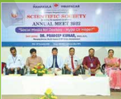
The annual meet of scientific society was conducted on 16th of December 2022. The annual meet of scientific society was conducted on 16th of December 2022.