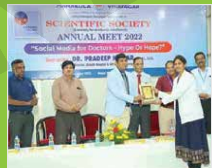
The prize distribution was followed by felicitation of the scientific society members.