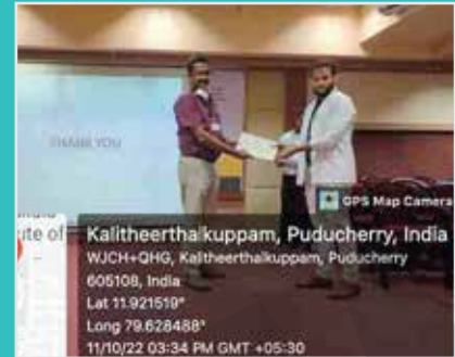
Management challenge of a Rare Retroperitoneal mass - A Case report

Location: Kalitheerthakuppam, Puducherry, India WJCH+QHG, Kalitheerthakuppam, Puducherry 605108, India Lat 11.921519° Long 79.628488° 11/10/22 03:34 PM GMT +05:30