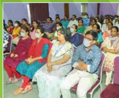
Scientific society members including faculties and post graduates from all clinical, pre and paraclinical departments participated in the grand event.